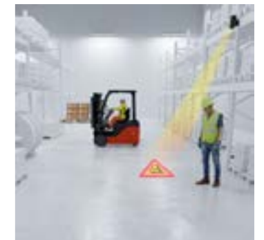
→ VISUAL ALERT SYSTEM