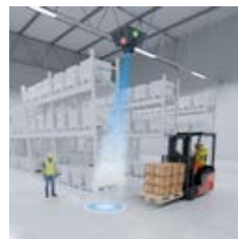
→ CROSSING GUARD SYSTEM