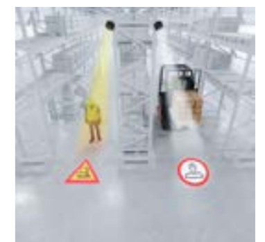
→ NARROW AISLE SAFETY