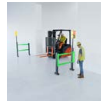
→ TRAFFIC CONTROL SYSTEM