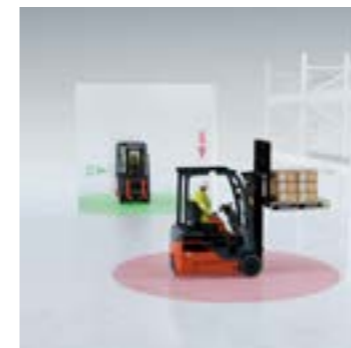
→ LOW SPEED AREA