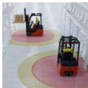
→ COLLISION AVOIDANCE SYSTEM