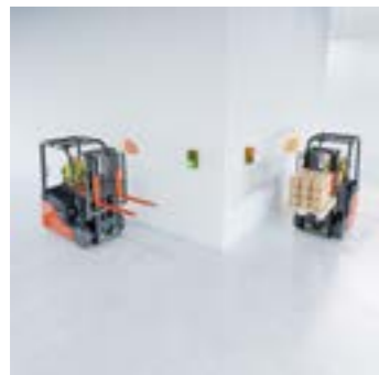
→ BLIND SPOT