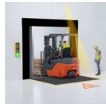
→ TRUCK DOCKING SYSTEM