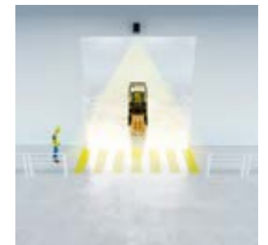
→ PEDESTRIAN CROSS SAFETY