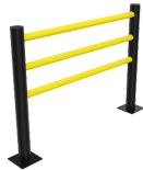
DELTA 3 BEAM